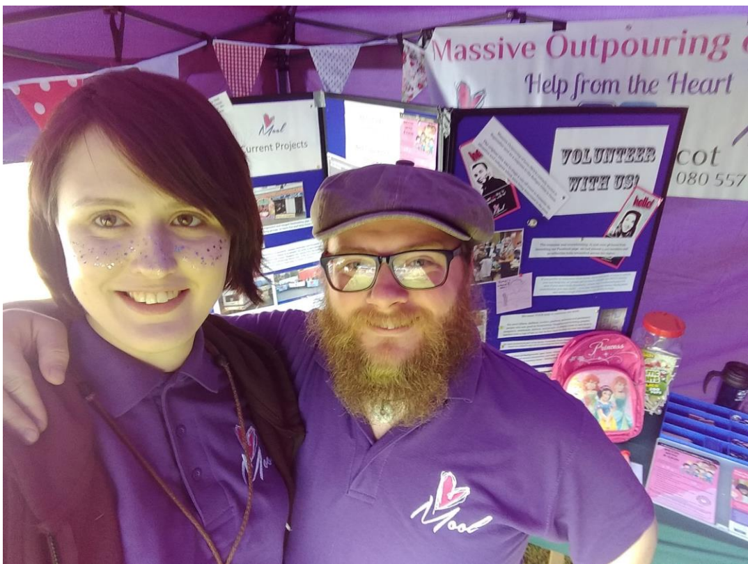
Eden Festival Outreach – June 2019