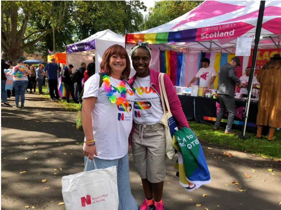
Pride in the Park – September 2019